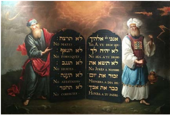
Moses, Aaron, and the Ten Commandments, by Aron de Chaves, c. 1675

https://drive.google.com/file/d/1zU6qyNkw2lr2XjK-sl1a4wo7pCH47KgLt/view